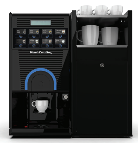
GAIA STYLE RY EASY + FRESH MILK MODULE (OPTIONAL ACCESSORY)

GAIA STYLE RY, automatic hot beverage dispenser, available both in espresso coffee from beans and instant beverages versions.