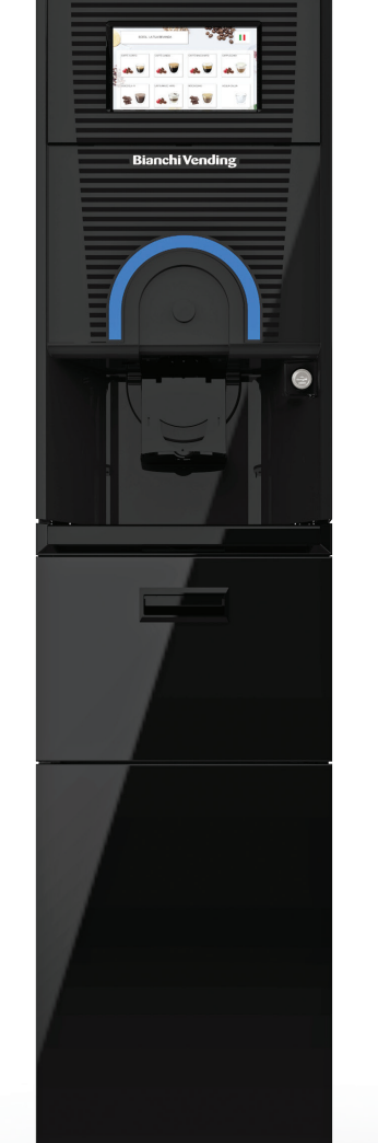
GAIA STYLE RY TOUCH 7" + CABINET