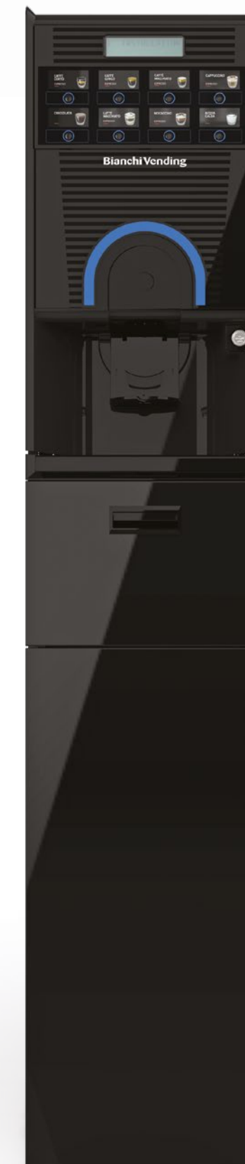
GAIA STYLE EASY + CABINET

♡ A safe break is a break that keeps people smiling: because peace of mind is essential for total enjoyment.