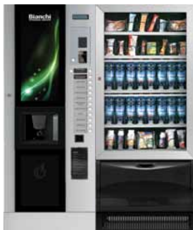
LEI 400 PP + VISTA M