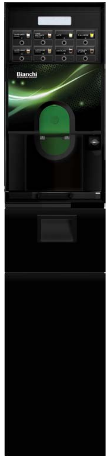
GAIA STYLE + CABINET